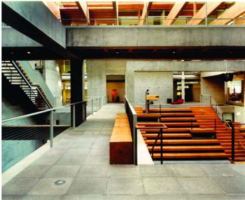
Allied Works Architecture, Wieden+Kennedy Advertising Agency, level 4 and atrium, penthouse structure above. This photo shows the insistence of Cloepfil's public spaces, and how his boundaries of public and private start to blur as he acknowledges our mutual ownership of cityscapes.

Perhaps the most overt suggestion of the inclusive and accessible responsibility that most of Cloepfil's buildings assume is found in the Emporis Building, or Wieden+Kennedy Advertising Agency in Portland, Oregon. This is a private building, but both the client's program and Cloepfil's idealism have allowed the gutted center of the old warehouse to become something of a public auditorium. One citizen of Portland says: "It sounds like a great quasi-public amenity. There is such a great tradition of private auditoriums and ballrooms in PDX from the early 20th century- it's nice to see [the Weiden+Kennedy lobby] adding to the new tradition [of quasi-public spaces]. Love those hidden voids all over town. It makes for a great tour of the city- the beautiful guts of PDX." 2 Cloepfil expresses pride that the auditorium portion of this remodeled building has become a cherished gathering- and trading-place of ideas. It is this intrusion of the public entitlement into the private realm that so poignantly illustrates Brad Cloepfil's almost subversive agenda, a kind of 'spatial egalitarianism'.